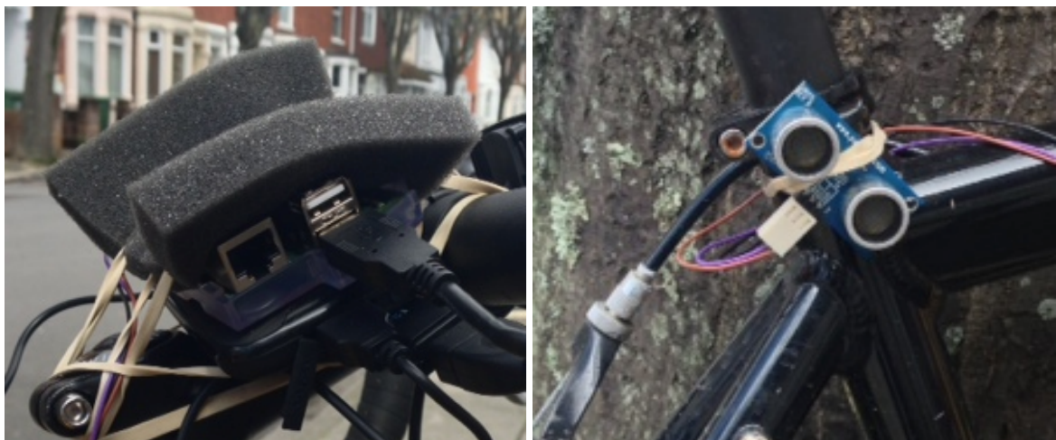
fig1. The First Prototype

A first prototype was created in March 2013. We used a lot of rubber bands, foam, a Raspberry Pi, a GPS unit, a battery pack, and a single ultrasonic sensor attached to the seatpost.