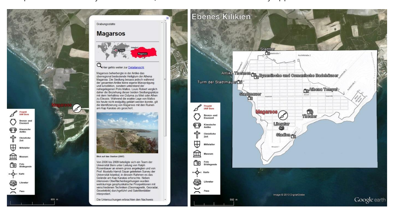
Figure 2 – Fieldproject Magarsos, text box and map with the reconstruction of the settlement system

The use of a virtual globe as a tool for archaeological visualization allows the integration of heterogeneous data sources, such as ancient maps, satellite images, photographs, texts, as well as bibliographies and results of archaeological excavation and survey projects. This approach provides anyone with the opportunity to explore the structure of ancient settlements and compare them not only to each other, but also to their modern day appearances.