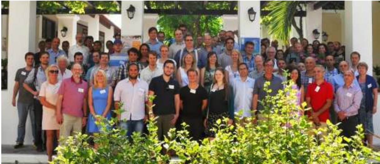
The 'Family Photo' from the first Share-PSI workshop, Samos 30 June – 1 July 2014

are proud that since the project began, two more partners have joined. These are Open Data France and the Albanian Institute of Science which has an active and effective programme around open government data in that country.