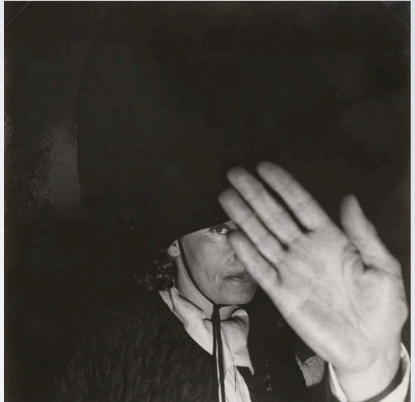
Georges Dudognon, Greta Garbo in the Club St. Germain , ca. 1950s gelatin silver print Collection SFMOMA, Foto Forum purchase © Georges Dudognon