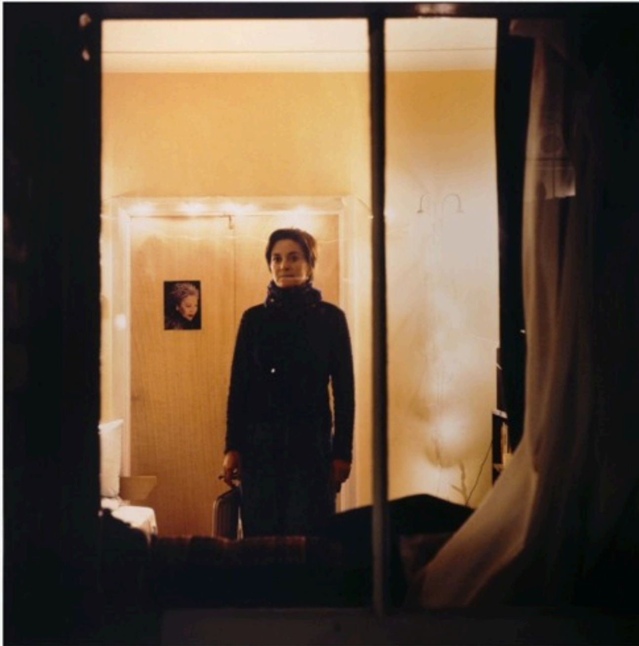
Shizuka Yokomizo, Stranger No. 2 , 1999 chromogenic print Collection SFMOMA, Accessions Committee Fund purchase