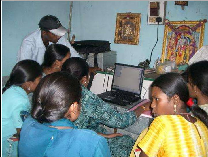
Computer-skills camp in Nakalabande, Bangalore (MSR India, Stree Jagruti Samiti, St. Joseph's College)

Collaborate with development-focused organizations for sustained, scaled impact