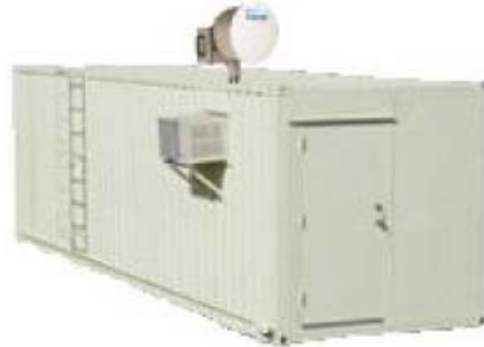
Figure 2 The LinkNet Resource Container

The LinkNet Resource Container concept caters for robust and sustainable performance. Installing off the shelf solutions in rural areas carries a great risk of failure. In fact, studies have shown that 75% of communications facilities like Internet Café's in rural areas have stopped functioning within two years! For this reason all hard- and software used for LinkNet configurations are preconfigured and wired at the production site at Macha. Pre-installing and pre-testing hard- and software will ensure immediate functionality. The LinkNet Resource Container is rented out, tuned for the specific requirements of the rural LinkNet members.