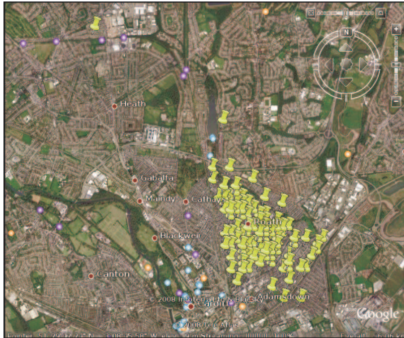
Figure 2 – Points labelled ‘Roath’, mined from Gumtree in Twaroch et al (April 2008)

The main problem with these techniques is identification of suitable sources. There is much research within this area that make use of sources such as Flickr, Geograph, Gumtree and Geonames but using individuals websites is proving more problematic due to their lack of formal structure.