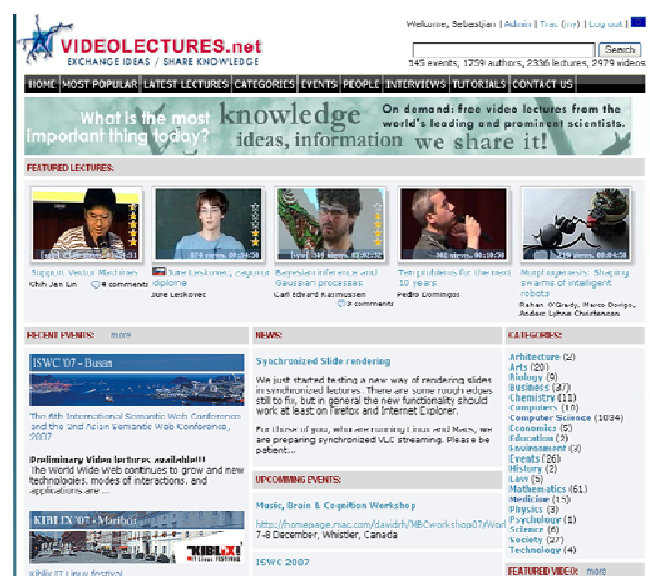
1. Videlectures.Net front page

The portal is becoming a major reference tool for academic researchers and in this sense new frameworks and future plans are being prepared aiming at becoming an e-science video reference with a possibility of being a base line media for live streaming of local and global events, building up a major consortium of high quality universities that would provide a qualitative stream of future planned and existing training programs. One other major goal is to cover all the major world scientific conferences for general and specific scientific users in different areas and to expand the academic disciplines for every possible viewer to Fine Arts, Humanities, Social studies and Law.