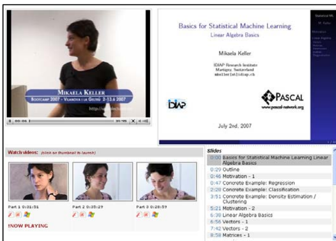
2. Synchronization user interface

From the viewers' perspective, the lecture can be validated and ranked, comments for debate can be added, the video can be accordingly categorized and the presentation (ppt. PDF and other formats) can be downloaded or viewed as a separate page. A major advance in the respective field is the feature of videos synchronized with presentations http://videolectures.net/bootcamp07_keller_bss (see picture 2.) which offers larger comprehension value. Related videos are also shown, and the users' personal history is placed as a reference tool. The videos are subtitled in two different video formats, .wma and .flv. That is due to different user software habits and thus a more effective public performance.