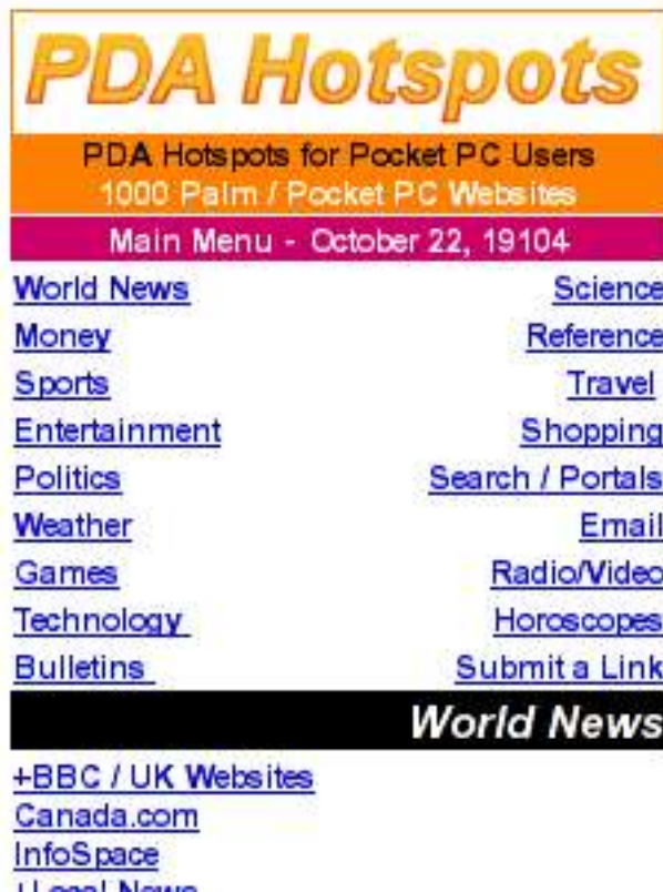
On a PDA