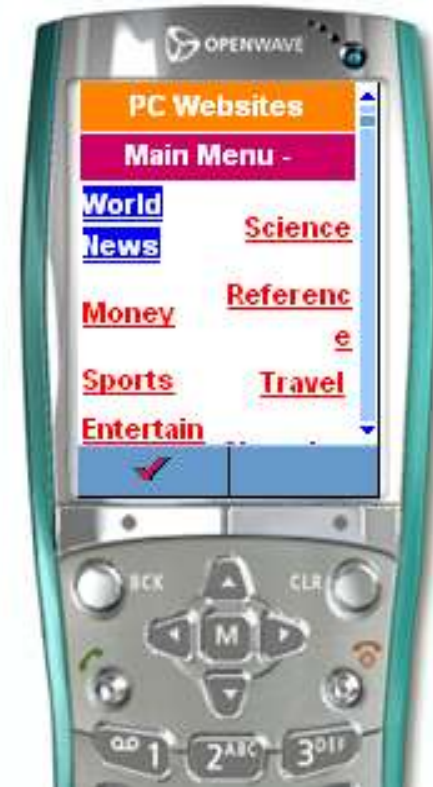
On a cell phone